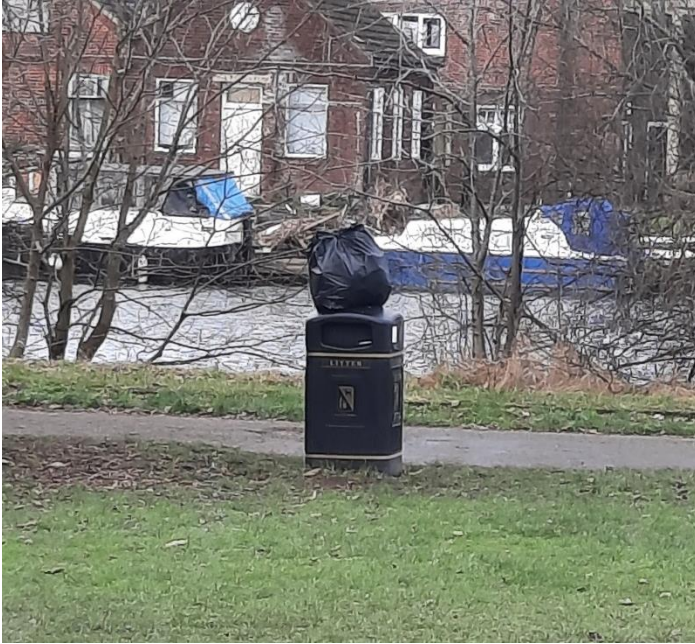
Photo 2 domestic waste in green spaces bins